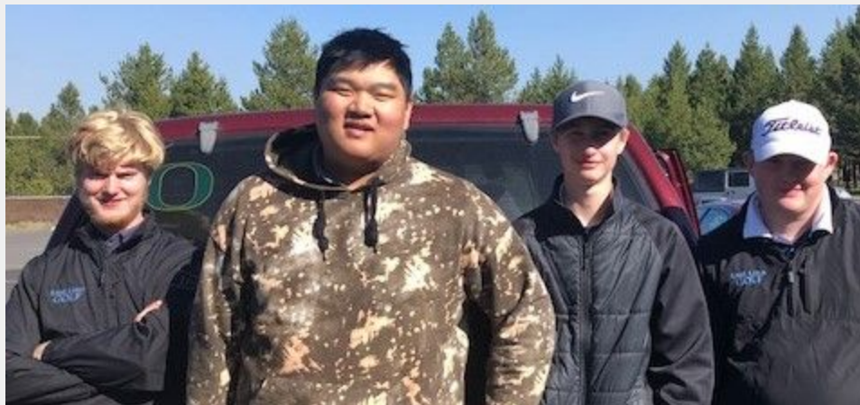
Golf Team at La Pine

Middle School Track Team compete at Linus Pauling Middle School on Thu., May 9th starting at 4:00 pm. At their previous meet (District Meet at Jefferson High School) the Girls Varsity Team placed 1st. Here are the results for all East Linn athletes placing 3rd place or higher: