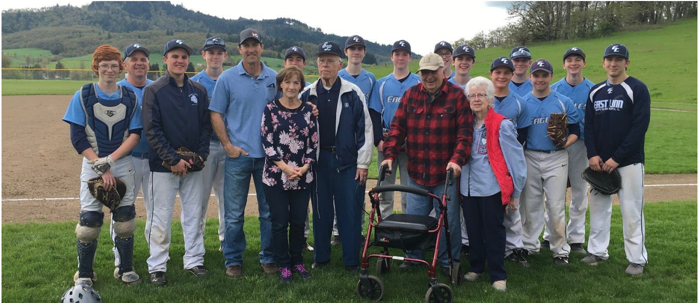
April 23rd Baseball Field Dedication Game

Spring Festival "America the Beautiful" is around the corner. Mark your calendar to attend this fun event at East Linn on Tue., May 21st at 4:00 pm. Bring your lawn chair, family and friends. The event will include over 20 showcases displaying the talents of East Linn students. Dinner will include hamburgers or hotdogs with side dishes and a drink for $5. Visit our "Dessert by Donation" table for a yummy dessert. The reenactment will be "Operation Rolling Thunder" - A Vietnam Battle. Don't miss out on this great event.