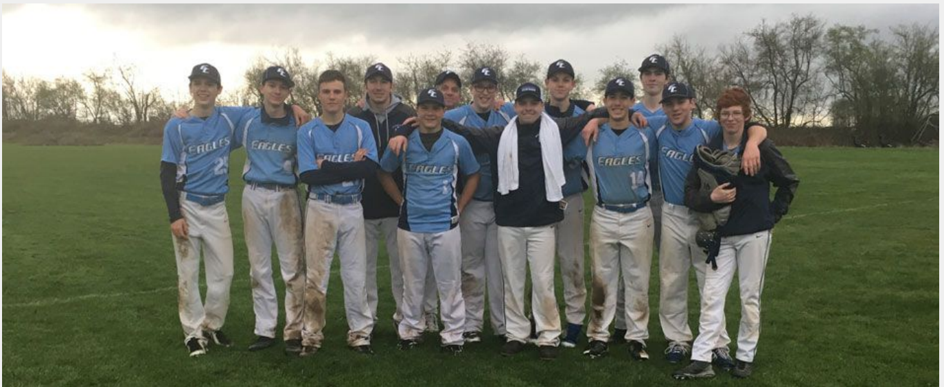
Baseball Team at Central Linn. The team did a great job! A lot of excitement, grass stains and mud.