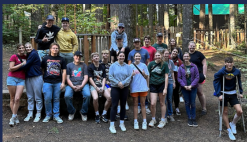
Senior Fall Experience Camp Dakota